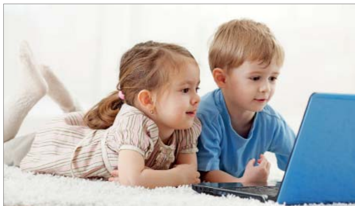
The photographs on the cover and pages 2-3: Thinkstock, Getty Images